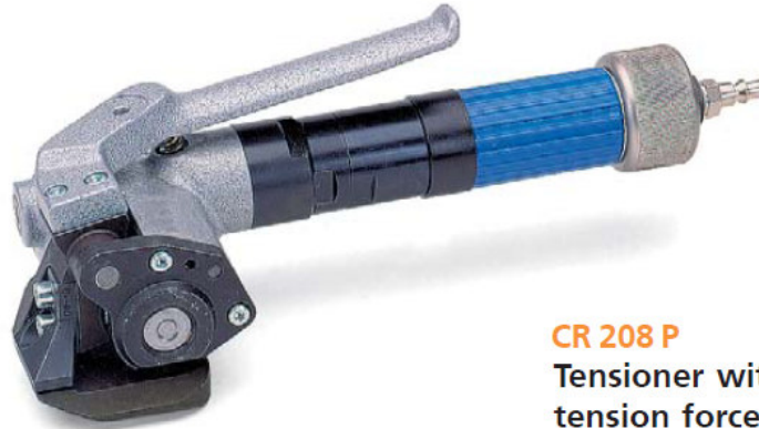
CR 208 P Tensioner with high tension force