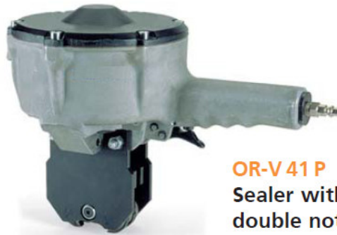
OR-V 41 P Sealer with double notch seal