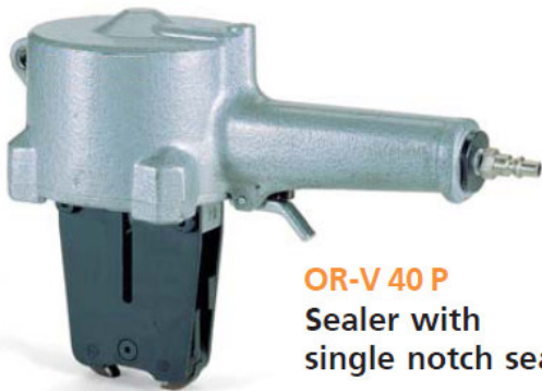
OR-V 40 P Sealer with single notch seal